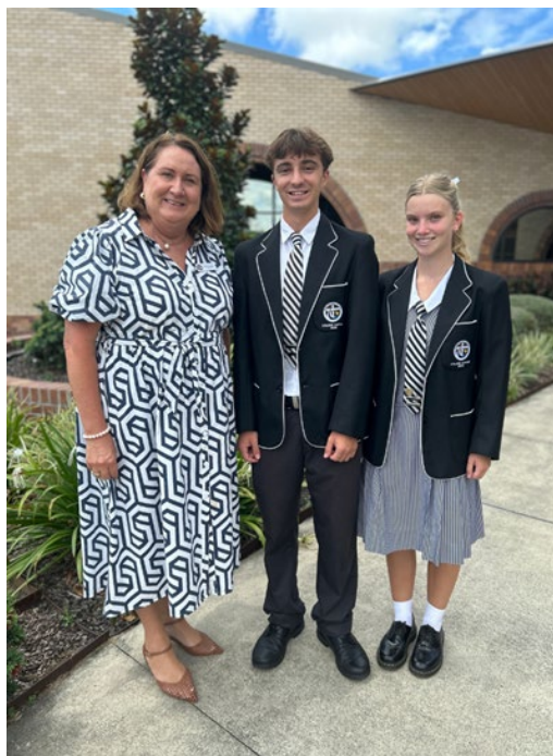
© Brisbane Catholic Education, Siena Catholic College (2025)