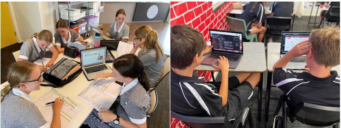
© Brisbane Catholic Education, Siena Catholic College (2022)

A condition of their access to these services is that all students and parents sign an Information Technology Use Agreement. The ICT and Laptop Policy Guidelines and Use Agreement clearly outline the expectations of the College with regards to ICT use.