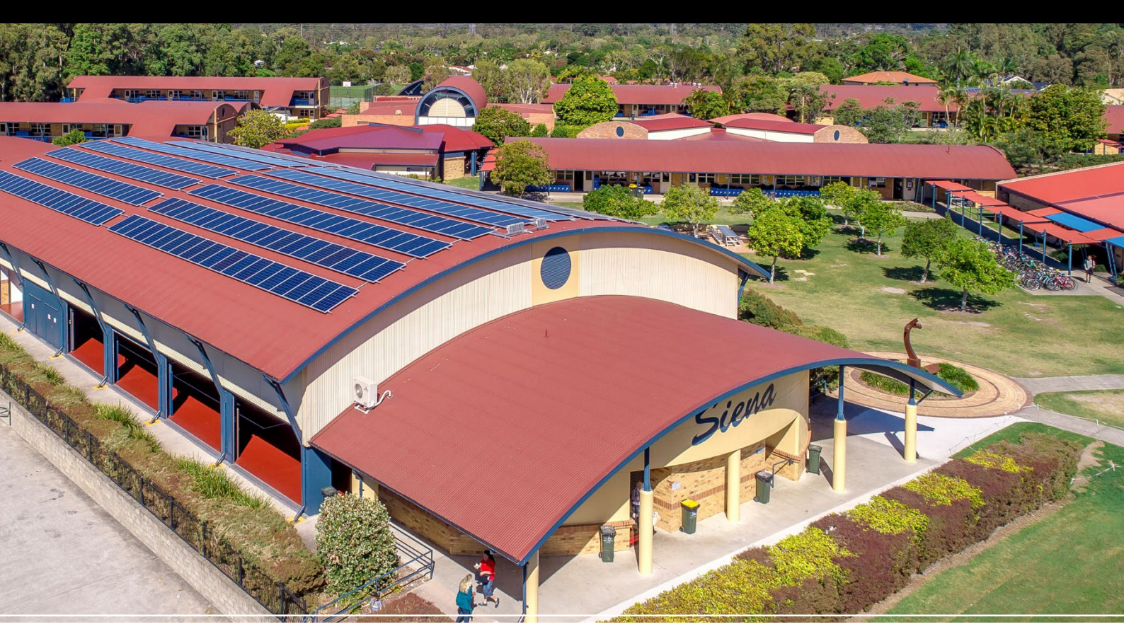
Document current as at November 2023